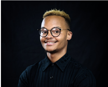
Faku Founder & CEO

‘Alone we can go far, together we can go further’